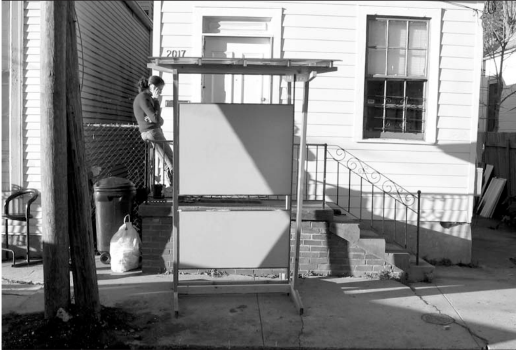
Notice board, freshly installed in the community.

then the Neighborhood Story Project and the University of New Orleans have developed a series of posters highlighting the creative and cultural contributions of residents of the Seventh Ward for installation on the notice boards. Two of the notice boards have also been moved around the neighborhood to support a mobile art exhibit.