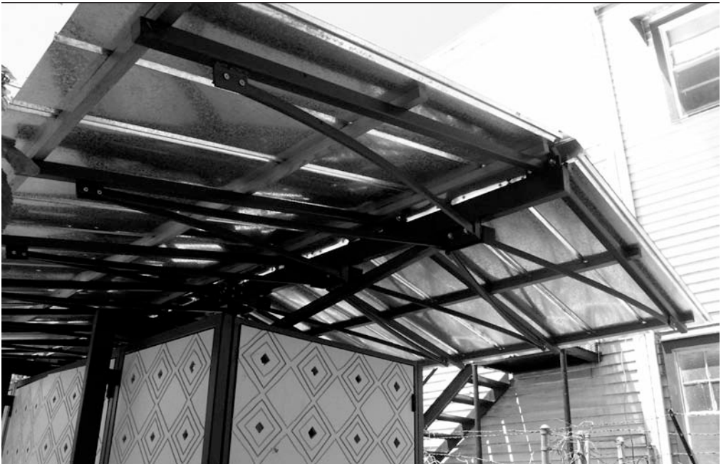
The tool shed roof, with delicately patterned, incised wall panels, inspired by African textiles.