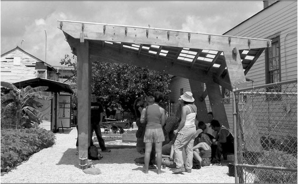
The shade pavilion is in the foreground and the tool shed is beyond it, to the left.